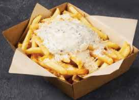
A12 Fries with Truffle Mayo $7.50

WHETHER YOU CALL THEM FRIES, FRITES, CHIPS OR, AS THE AMSTERDAM LOCALS DO "PATATJES", WE CAN ALL AGREE ON ONE THING: THEY ARE SIMPLY DELICIOUS.