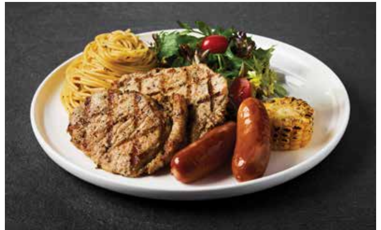
M5 Pork Chop & Arabiki Sausage $14.90 with Black Pepper sauce