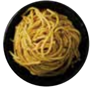
Spaghetti Aglio Olio (contains chilli flakes)