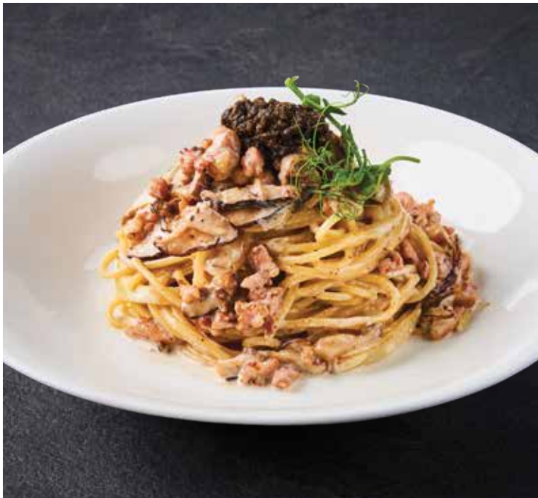
P4 Truffle Alfredo $14.90 Spaghetti with Bacon, Mushroom in creamy Truffle Parmesan sauce