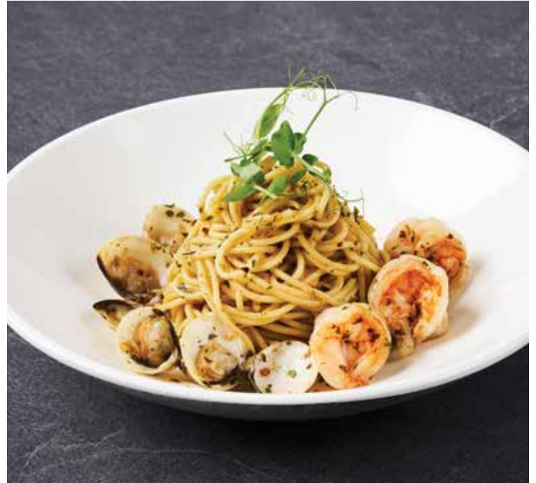
P7 Prawn & Vongole Aglio Olio $12.90 Spaghetti with Prawn, Vongole, Chilli Flakes and Parsley