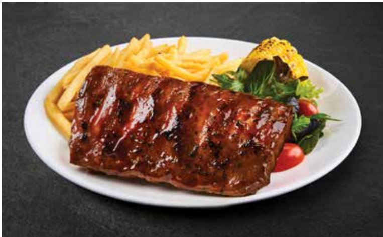
M4 Signature Roasted BBQ Pork Ribs (1/2 slab) $17.90