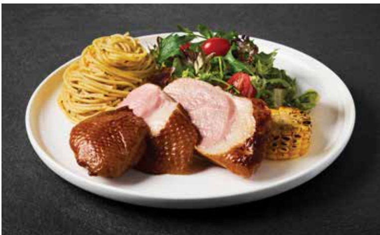
M6 Smoked Duck Breast $15.90 with Brown Onion gravy