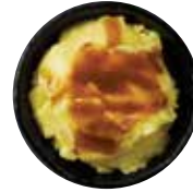
Mashed Potato with Brown Onion gravy