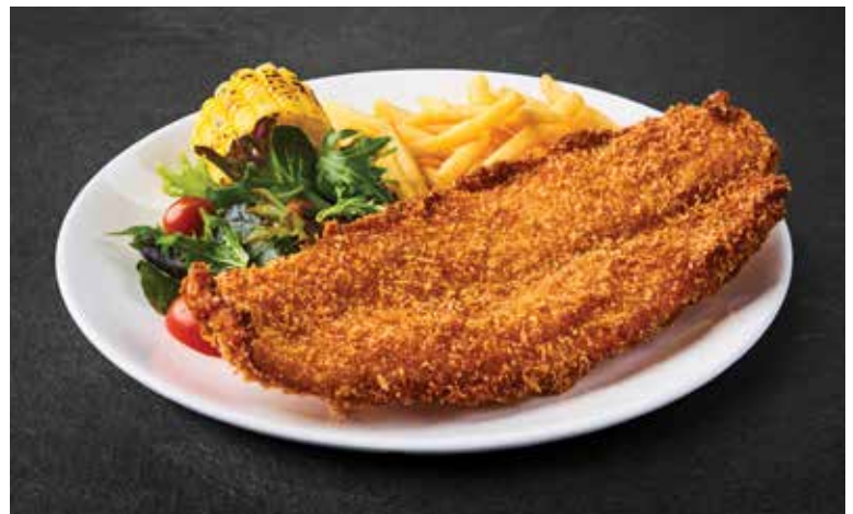
M15 XL Fish & Chips $13.90 with homemade Tartar sauce