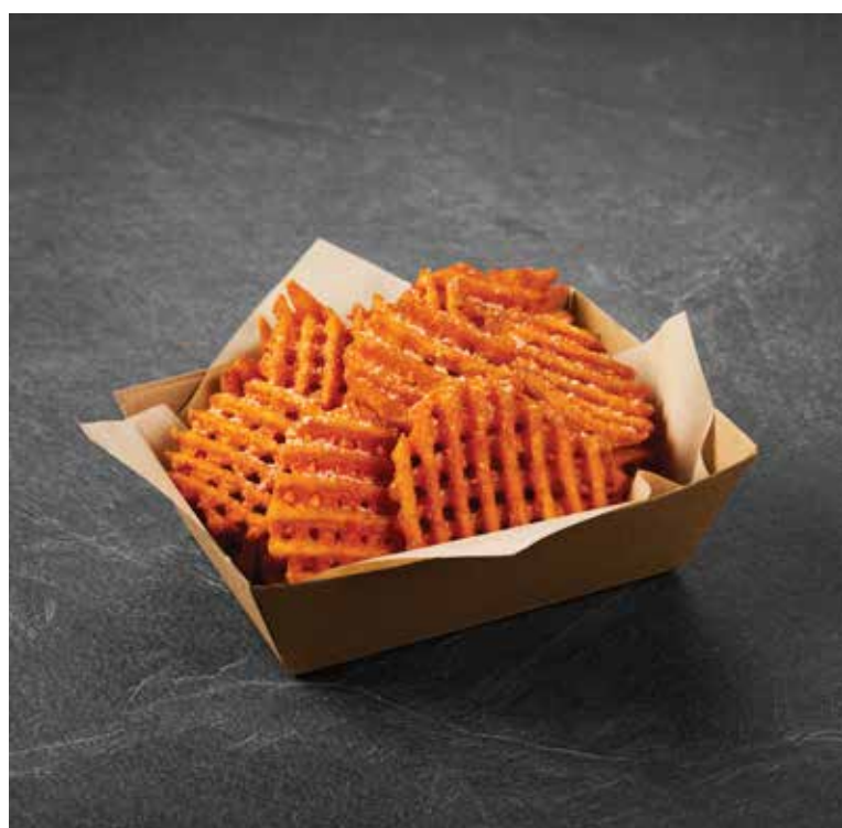
A11 Sweet Potato Waffle Fries $7.00