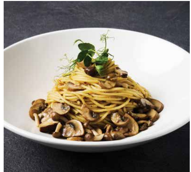
P9 Trio Mushroom Aglio Olio $10.90 Spaghetti with Medley of Mushroom, Chilli Flakes and Parsley