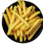
Sea Salt Fries