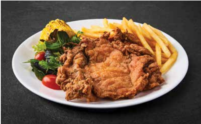
M12 Signature Crispy Chicken Cutlet $13.00 with homemade Tartar sauce