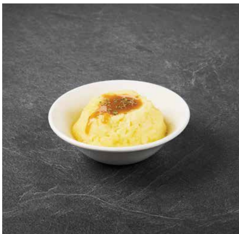
A10 Mashed Potato $4.00 with Brown Onion gravy