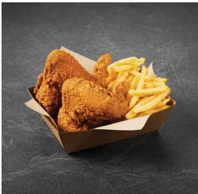
A8 Signature Crispy Wings $7.90/2pcs with Sea Salt Fries $10.50/3pcs