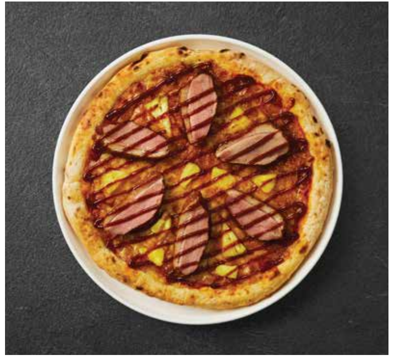
PZ4 Smoked Duck $17.50 Smoked Duck Breast, Mozzarella, Pineapple, Barbecue sauce