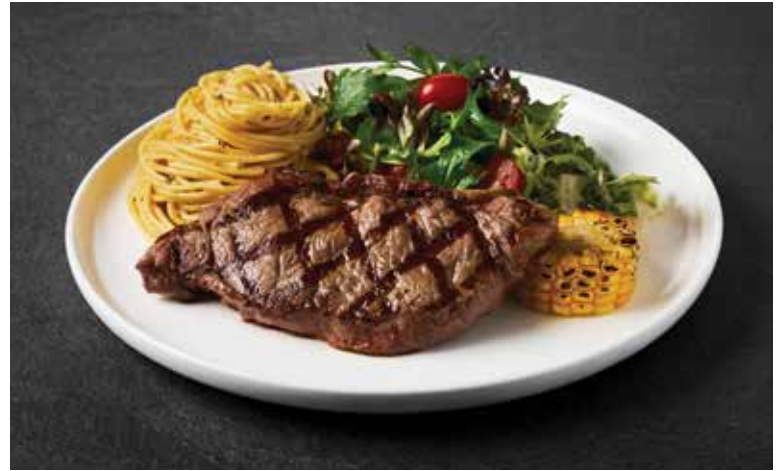
M3 Pure South N.Z. Sirloin Steak (200gm) $21.90 with Black Pepper sauce