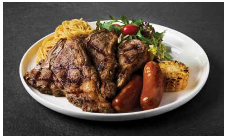
M7 Lamb Chop & Arabiki Sausage $18.90 with Black Pepper sauce