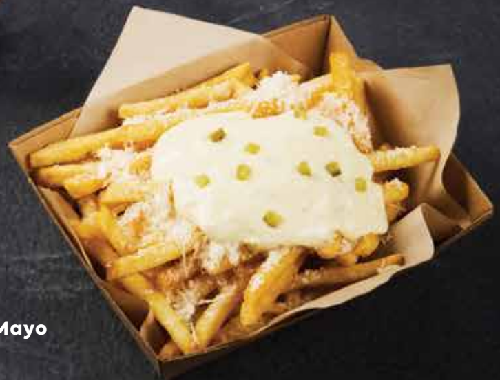
A15 Fries with Sour Mayo $6.50