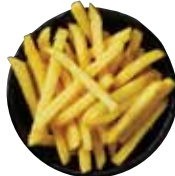
Sea Salt Fries