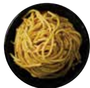
Spaghetti Aglio Olio (contains chilli flakes)