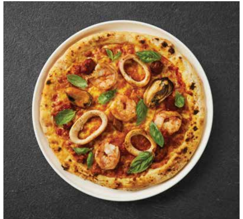
PZ10 Seafood Medley Prawn, Squid, Mussel, Mozzarella, Seafood Tomato sauce