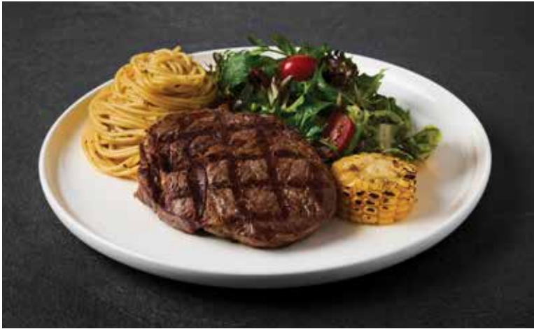
M2 Pure South N.Z. Ribeye Steak (200gm) $20.90 with Black Pepper sauce