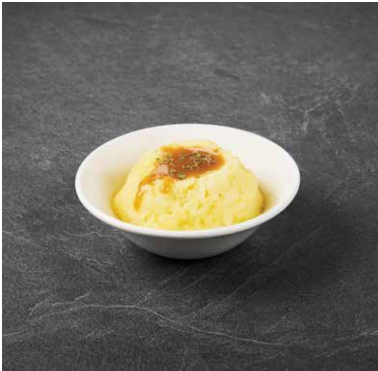
A10 Mashed Potato $3.50 with Brown Onion gravy