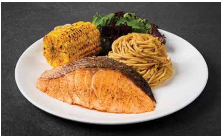
M14 Grilled Norwegian Salmon $14.90 with Mango Salsa