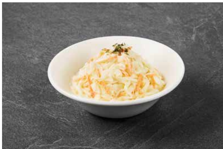
A7 Coleslaw with homemade Mayonnaise