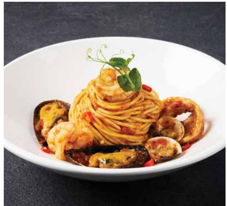
P5 Seafood Arrabiata $10.90 Spaghetti with Prawn, Mussel, Squid, Clam, Chilli Padi in Tomato Herb sauce