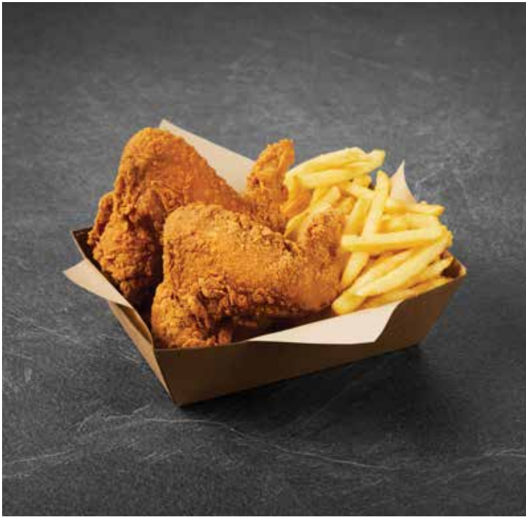
A8 Signature Crispy Wings $6.90/2pcs with Sea Salt Fries $9.50/3pcs