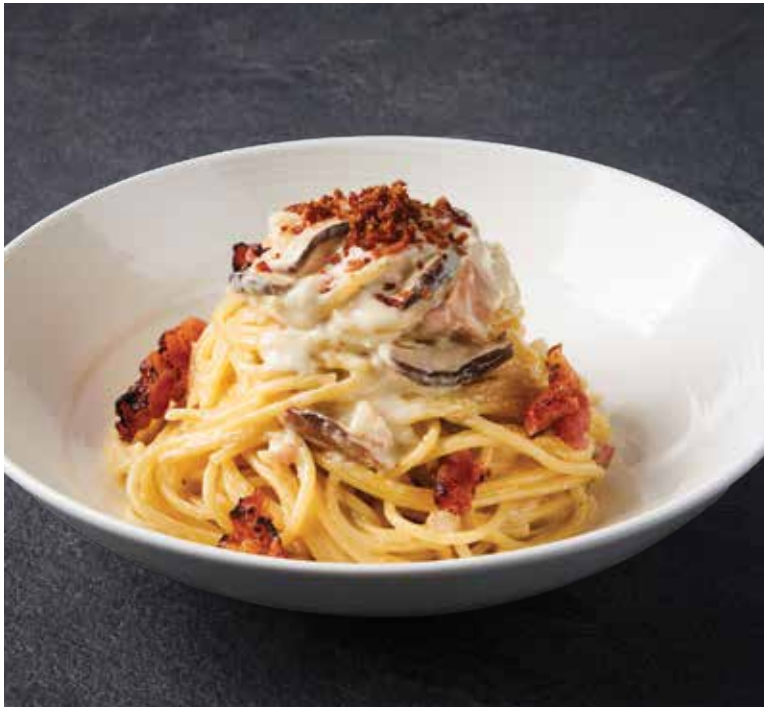
P2 Spaghetti Carbonara $9.90 Spaghetti with Bacon, Mushroom and Ham in Cream sauce