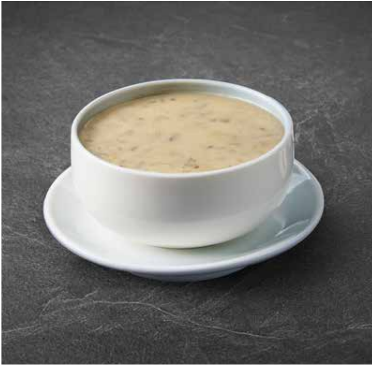
A1 Wild Mushroom Soup $3.50 Button Mushroom, Fresh Cream, with freshly baked Garlic Baguette