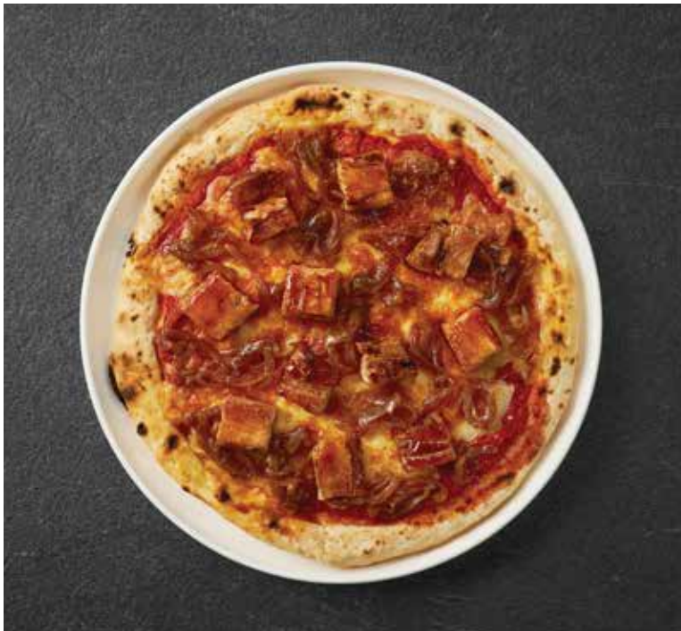
PZ9 Teriyaki Pork Belly Teriyaki Pork Belly, Caramelised Onion, Mozzarella, Teriyaki sauce