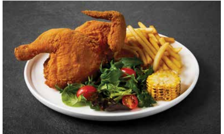
M11 Signature Crispy 1/2 Spring Chicken $11.90