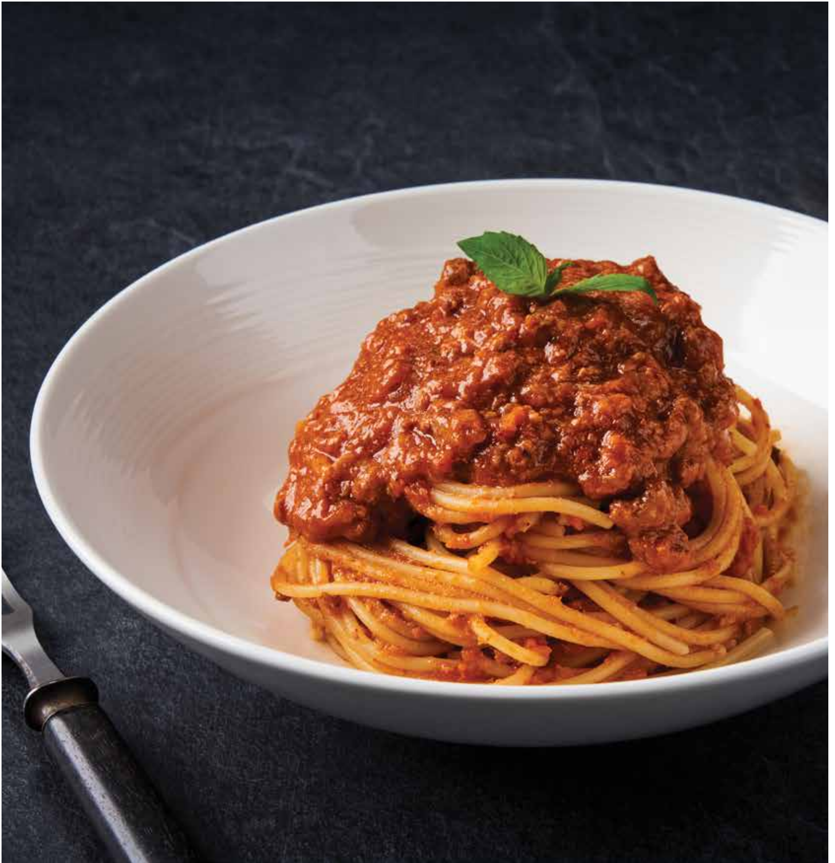
P1 Angus Beef Bolognese Spaghetti in Rich Tomato Meat sauce