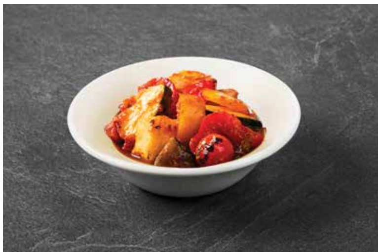
A6 Italian Ratatouille Stewed Summer Vegetables