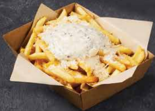
A12 Fries with Truffle Mayo $7.50

WHETHER YOU CALL THEM FRIES, FRITES, CHIPS OR, AS THE AMSTERDAM LOCALS DO "PATATJES", WE CAN ALL AGREE ON ONE THING: THEY ARE SIMPLY DELICIOUS.