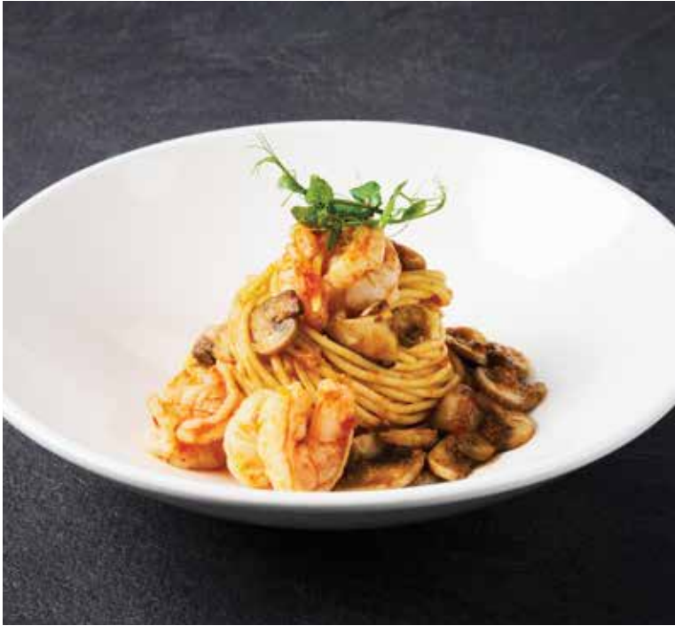
P6 Prawn & Shroom $10.90 Spaghetti with Prawn, Medley of Mushroom in Seafood Tomato Herb sauce