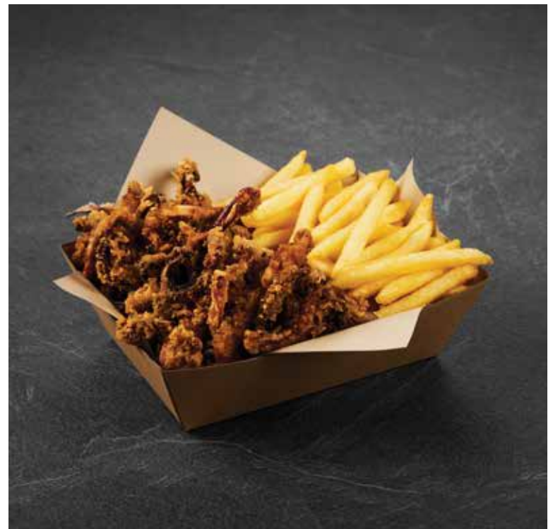
A4 Tempura Squid Tentacles $7.90 with homemade Tartar sauce