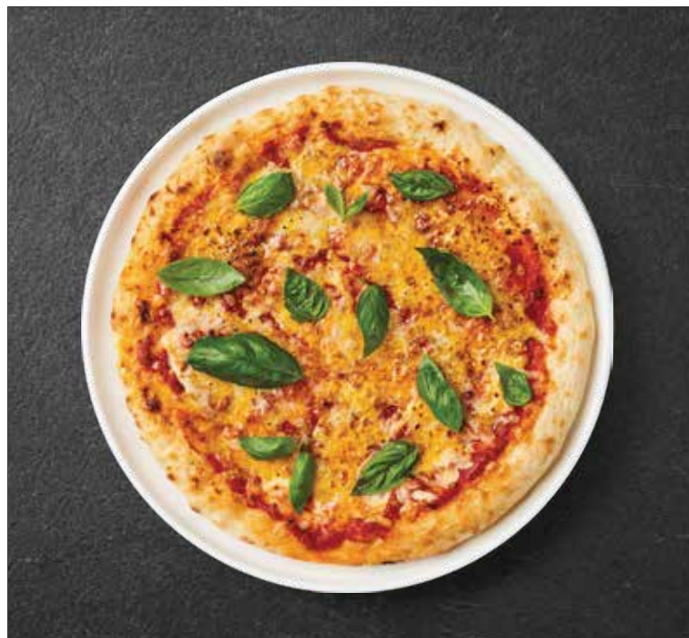
PZ5 Margherita $10.90 Cherry Tomato, Mozzarella, Parmesan Cheese