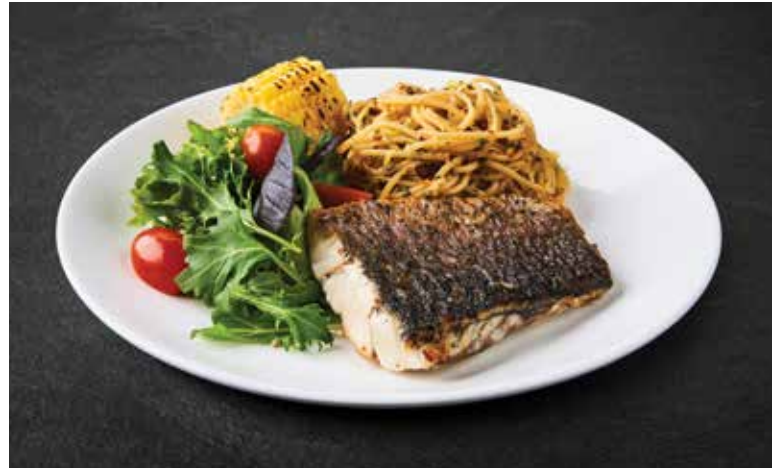
M13 Grilled Red Sea Barramundi $14.50 with Seafood Tomato sauce