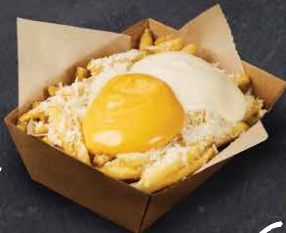
A14 Fries with Cheese Mayo $6.50