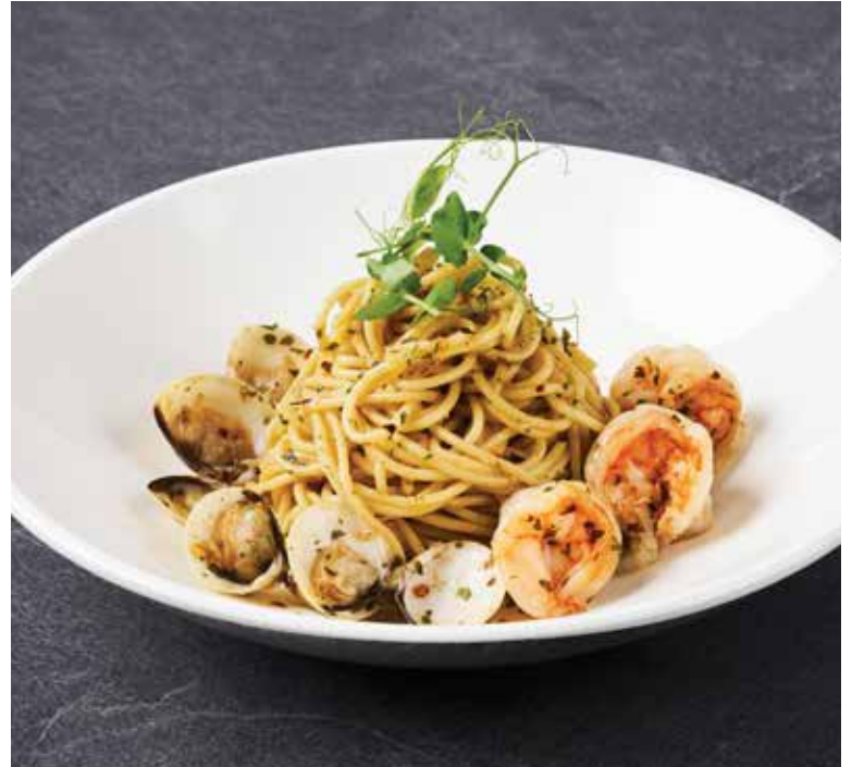
P7 Prawn & Vongole Aglio Olio $10.90 Spaghetti with Prawn, Vongole, Chilli Flakes and Parsley