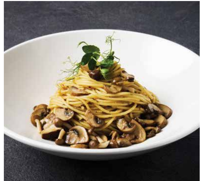
P9 Trio Mushroom Aglio Olio $8.90 Spaghetti with Medley of Mushroom, Chilli Flakes and Parsley