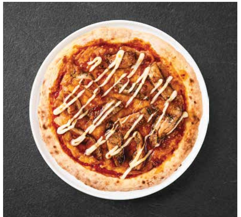
PZ12 Teriyaki Chicken Grilled Chicken, Mozzarella, Mayonnaise, Teriyaki sauce