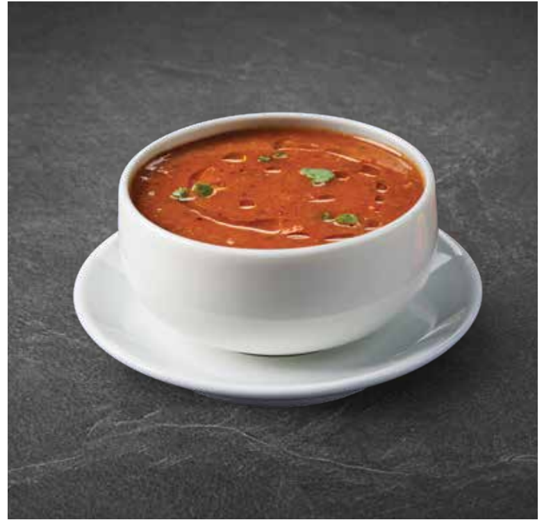
A2 Minestrone Soup $3.50 Seasonal Vegetables in rich Tomato soup, with freshly baked Garlic Baguette