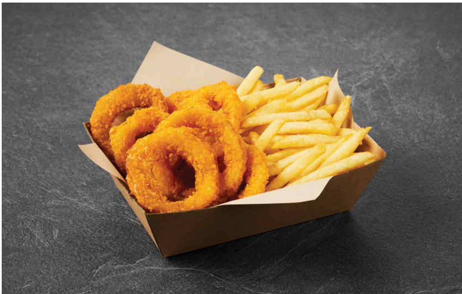
A5 Crispy Onion Rings with homemade Tartar sauce