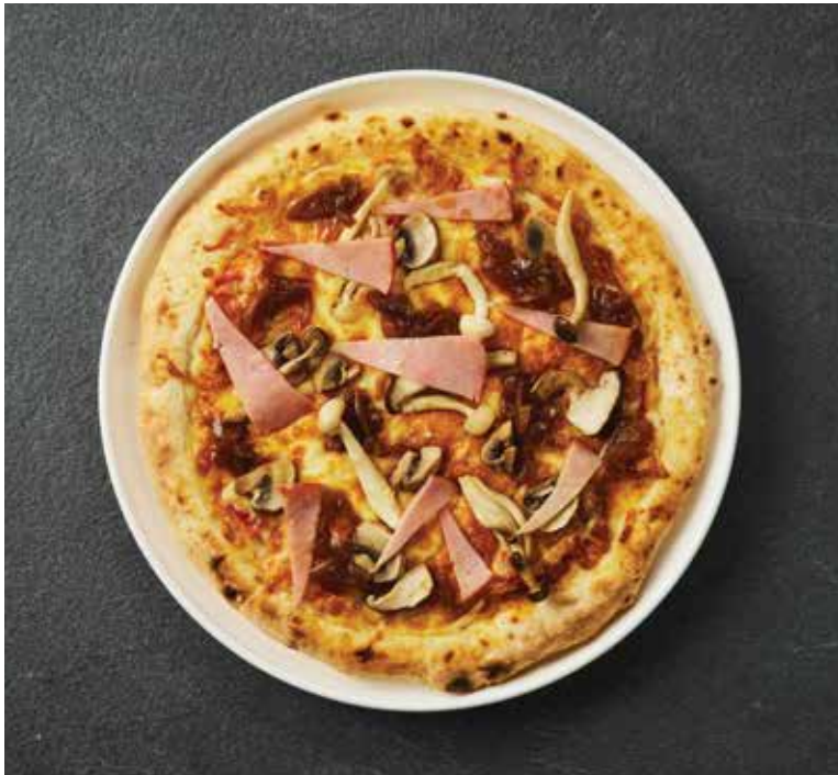
PZ3 Ham and Shroom $14.50 Ham, Medley of Mushroom, Caramelised Onion, Mozzarella