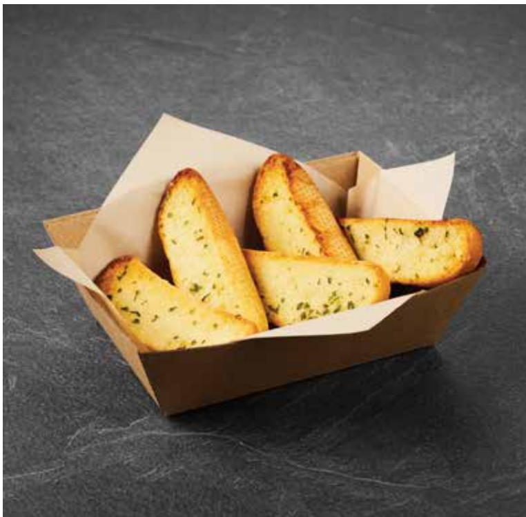
A3 Baked Garlic Baguette $3.50 Homemade Baguette with Garlic Butter