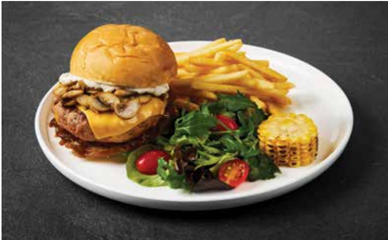
M10 Truffle Iberico Pork Burger $15.90 Iberico Pork Patty, Cheddar Cheese, Truffle Mayonnaise, Caramelised Onion and Sauteed Mushroom