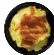
Mashed Potato with Brown Onion gravy