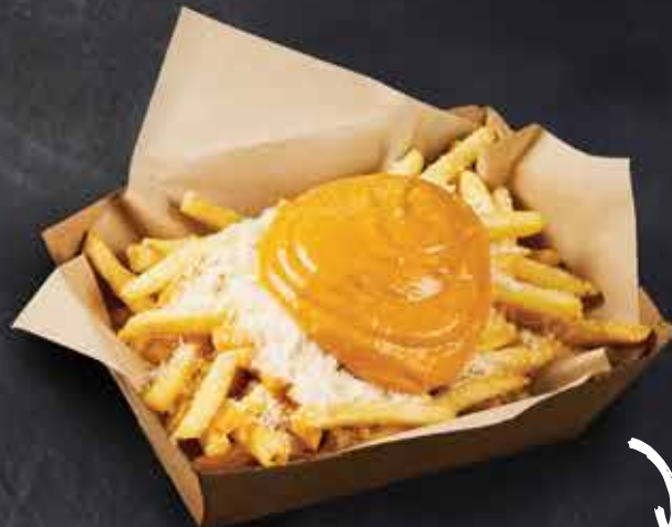
A13 Fries with Curry Mayo $6.50