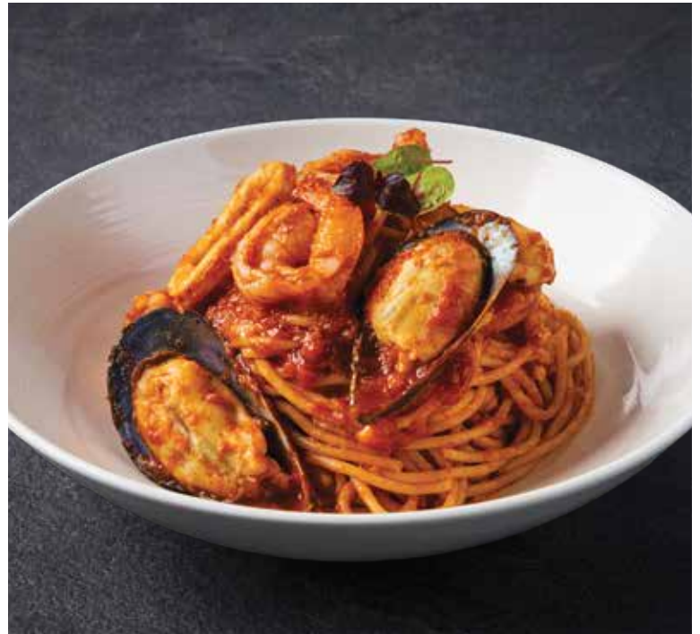
P3 Seafood Marinara $10.90 Spaghetti with Prawn, Mussel, Squid in Tomato Herb sauce