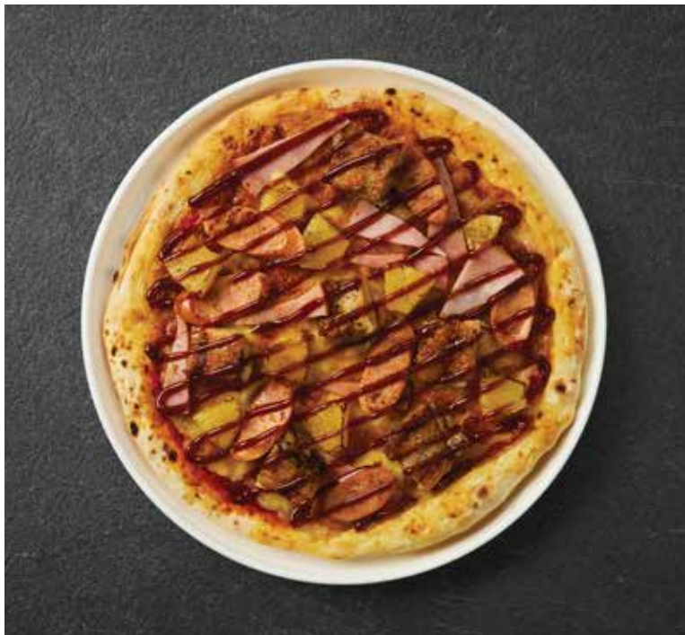
PZ11 BBQ Supreme Grilled Chicken, Ham, Arabiki Sausage, Pineapple, Mozzarella, Barbecue sauce