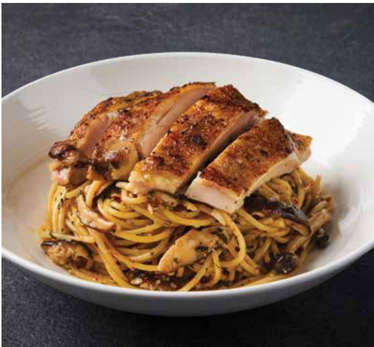
P8 Chicken & Shroom Aglio Olio $8.90 Spaghetti with Grilled Chicken, Mushroom, Chilli Flakes and Parsley