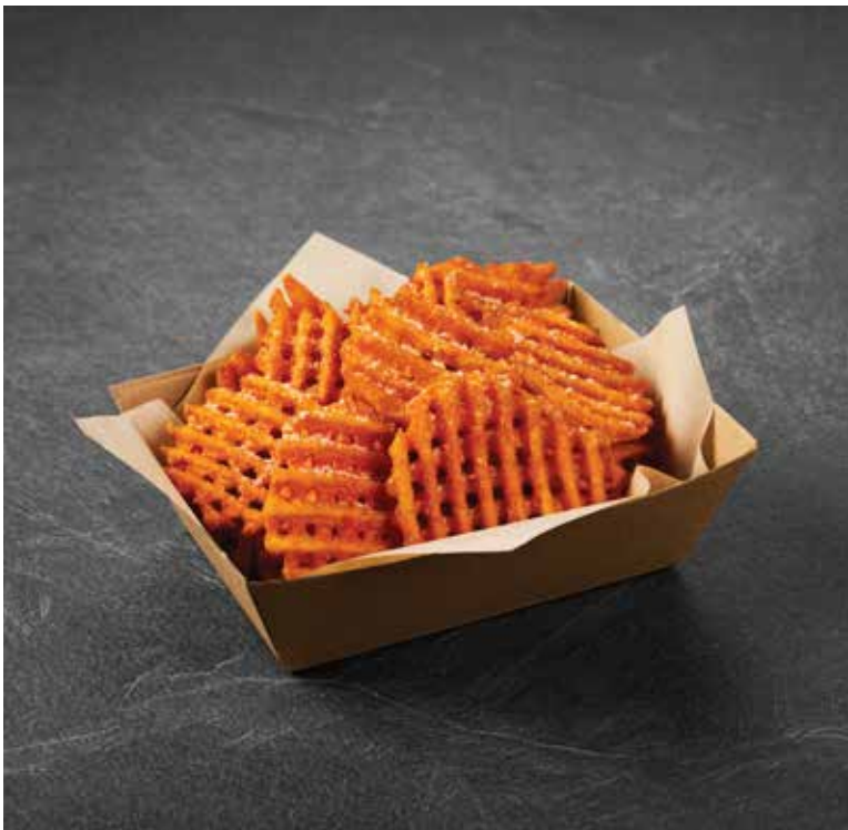
A11 Sweet Potato Waffle Fries $6.00