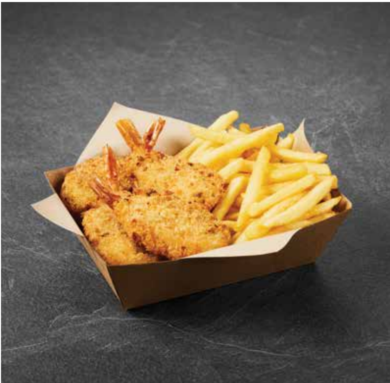
A9 Garlic & Herbs Prawn Bites $9.50 with homemade Tartar sauce